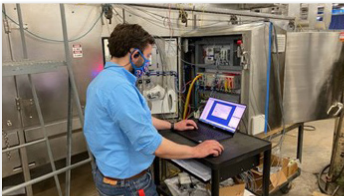
A controls engineer loads programs into the PLC and HMI. The engineering staff can easily move from the design floor to the plant and connect to work in progress while maintaining a connection to the CAD application or ERP.